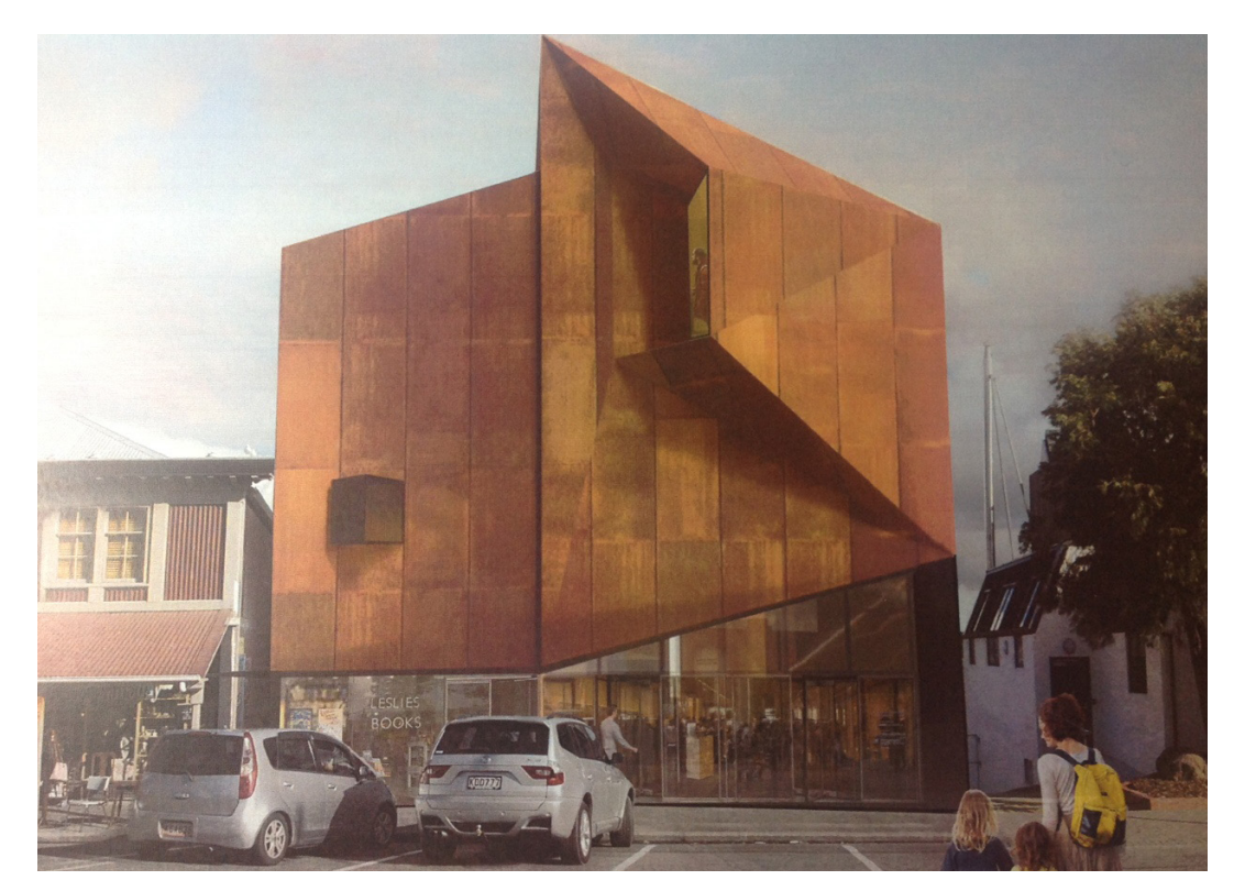
The Concept Design for the new Lyttelton Museum in London St